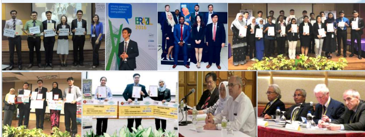
Figure 3: Some of the MLC & YPWLC events photos held in Malaysia and other countries from 2012-2019