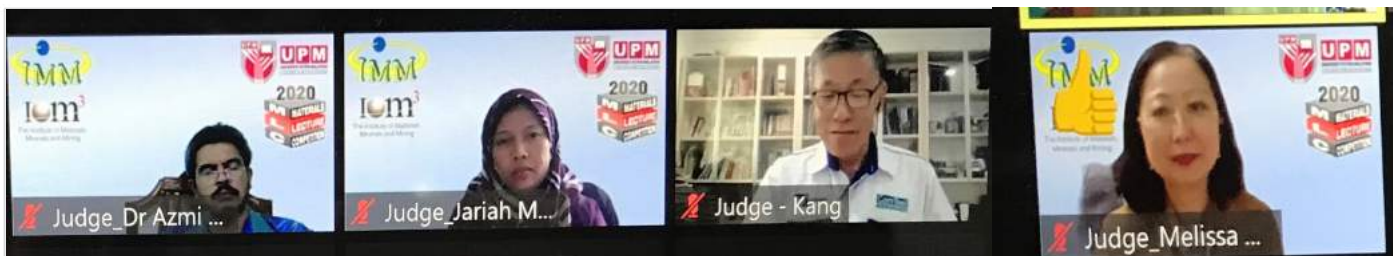
Figure 1: Virtual MLC2020 Panel of Judges